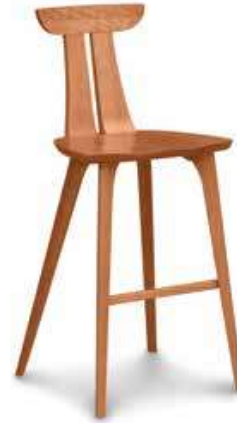
Estelle Bar Stool - seat height 30" 8-EST-65-XX