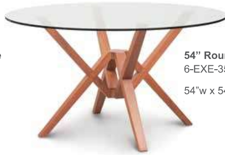
54" Round Glass Top Table 6-EXE-35-XX 54"w x 54"l x 30"h