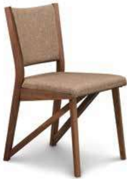
Exeter Chair 8-ESE-50-04

Upholstered items are available in a range of microsuede, fabric, UltraSuede®, UltraLeather® Original by UltraFabrics®, Elements Collection by Sunbrella or leather colors as well as COM (customer's own material). Please refer to the upholstery page of this catalog.