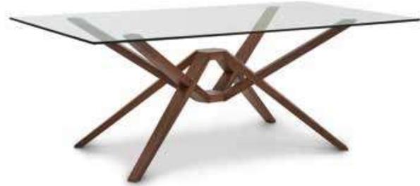
48" x 84" Glass Top Table