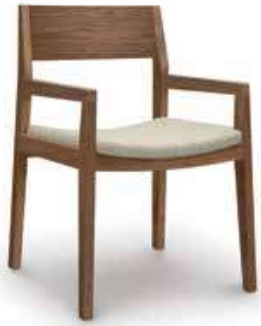
Iso Armchair 8-ISO-42-04