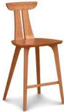
Estelle Counter Stool - seat height 26" 8-EST-60-XX