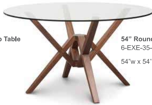
54" Round Glass Top Table 6-EXE-35-04 54"w x 54"l x 30"h