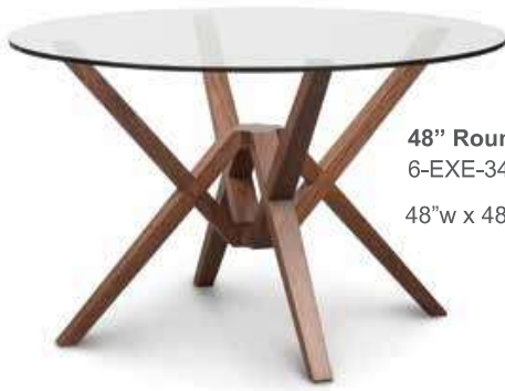
48" Round Glass Top Table 6-EXE-34-04 48"w x 48"l x 30"h