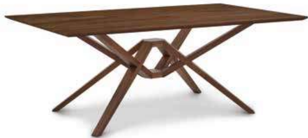
48" x 84" Table 6-EXE-13-04