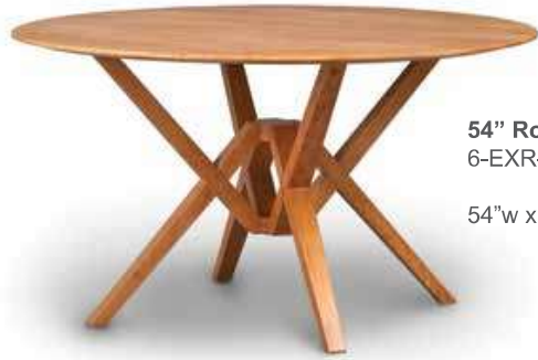
54" Round Table 6-EXR-54-XX 54"w x 54"l x 30"h