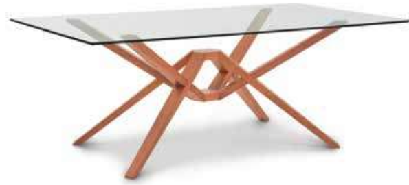
48" x 84" Glass Top Table