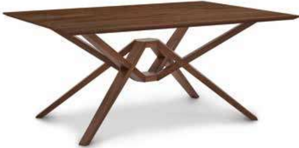
48" x 72" Table 6-EXE-12-04

Exeter tables are available in a range of fixed top sizes highlighting the unique geometry of the table base.