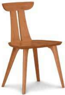
Estelle Side Chair 8-EST-50-XX