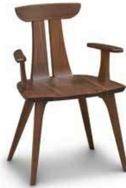
Estelle Arm Chair 8-EST-52-04