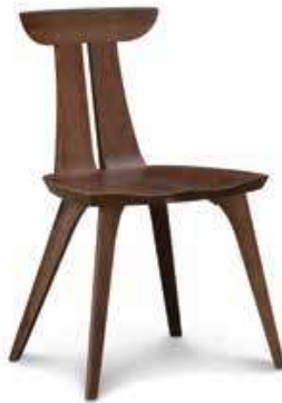
Estelle Side Chair 8-EST-50-04