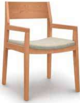
Iso Armchair 8-ISO-42-XX