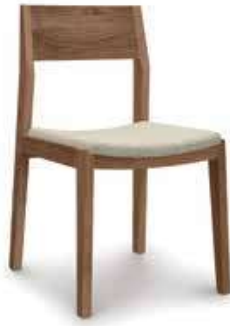
Iso Sidechair 8-ISO-40-04