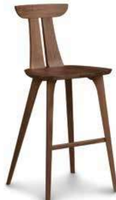
Estelle Bar Stool - seat height 30" 8-EST-65-04