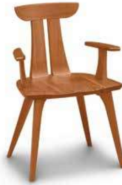
Estelle Arm Chair 8-EST-52-XX