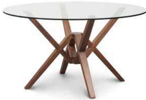
60" Round Glass Top Table 6-EXE-36-04 60"w x 60"l x 30"h