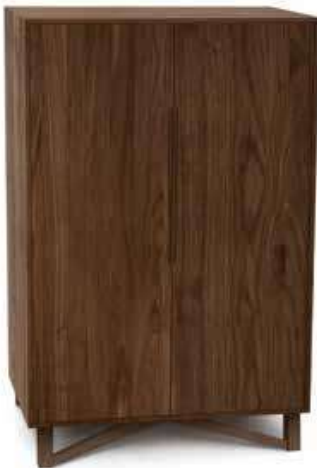
Bar Cabinet 4-EXE-80-04