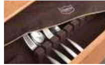
The silverware drawer is fitted with an anti-tarnish insert.