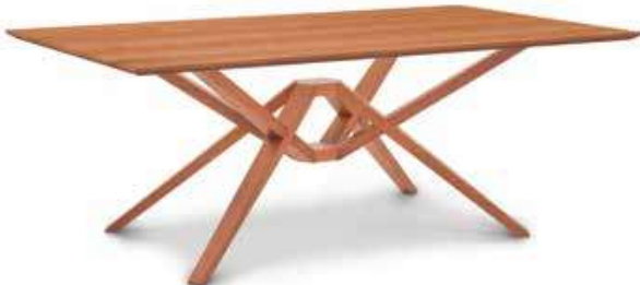
48" x 84" Table 6-EXE-13-XX