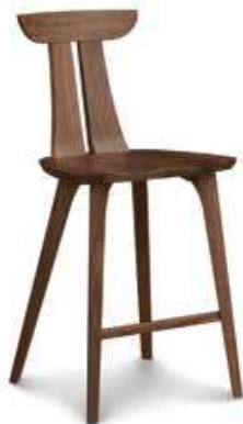
Estelle Counter Stool - seat height 26" 8-EST-60-04