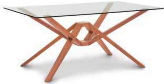
42" x 72" Glass Top Table

Exeter tables are available in a range of glass top sizes highlighting the unique geometry of the table base.