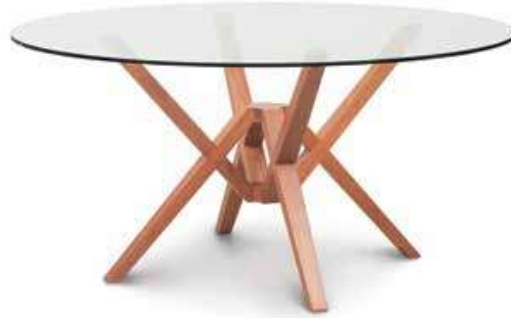
60" Round Glass Top Table 6-EXE-36-XX 60"w x 60"l x 30"h