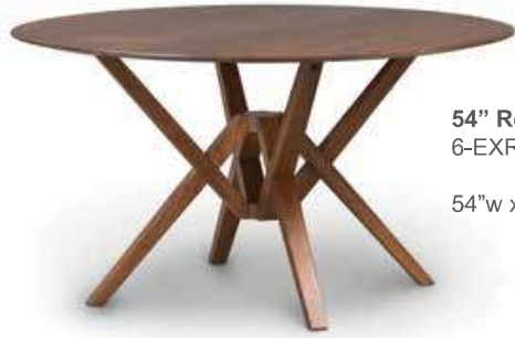
54" Round Table 6-EXR-54-04 54"w x 54"l x 30"h