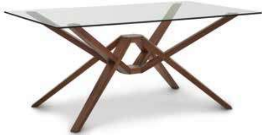
42" x 72" Glass Top Table

Exeter tables are available in a range of glass top sizes highlighting the unique geometry of the table base.