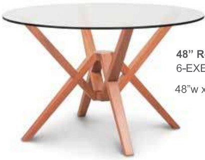
48" Round Glass Top Table 6-EXE-34-XX 48"w x 48"l x 30"h