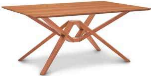
48" x 72" Table 6-EXE-12-XX

Exeter tables are available in a range of fixed top sizes highlighting the unique geometry of the table base.