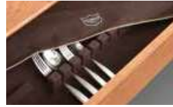
The silverware drawer is fitted with an anti-tarnish insert.