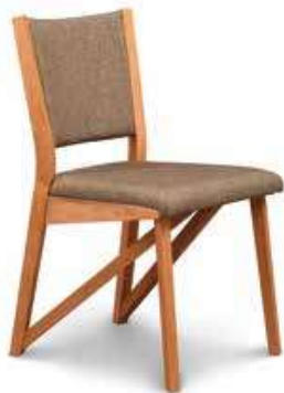
Exeter Chair 8-EXE-50-XX