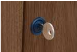
Bar Cabinet with Lock 4-EXE-80-04-LOCK