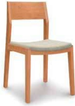
Iso Sidechair 8-ISO-40-XX