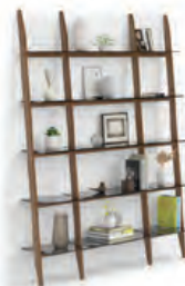
SYSTEM 570121 W 66 in | 168.5 cm