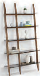
SYSTEM 570012 W 49 in | 127.5 cm