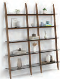
SYSTEM 570212 W 80 in | 204 cm