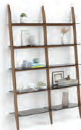
SYSTEM 570022 W 63 in | 160.5 cm