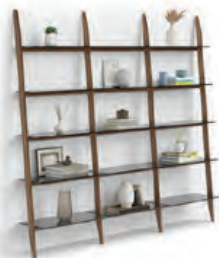
SYSTEM 570222 W 94 in | 239.5 cm

Height: 82.5 in | 209.5 cm Depth: 14 in | 36 cm