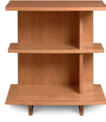
Nightstand - right 2-BER-02-XX