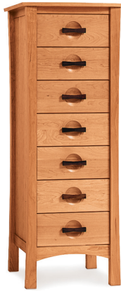
7 Drawer 2-BERC-70-XX