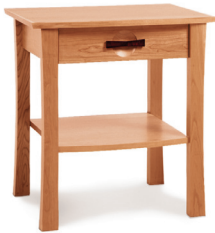
1 Drawer Nightstand 2-BERC-11-XX