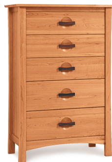
5 Drawer 2-BERC-50-XX