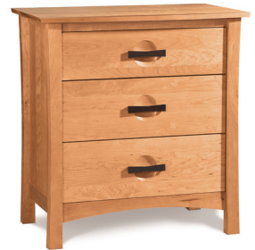
3 Drawer 2-BERC-30-XX