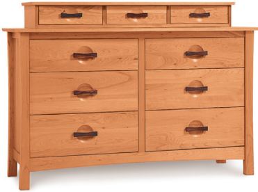
6 Drawer and Accessory Case 2-BERC-60-XX