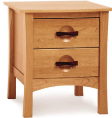
2 Drawer Nightstand 2-BERC-20-XX