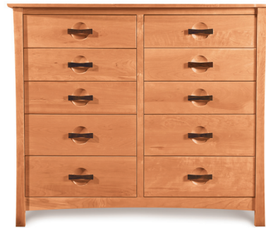
10 Drawer 2-BERC-80-XX