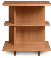
Nightstand - left 2-BER-01-XX